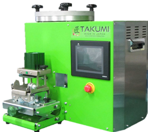
TAKUMI + Clamp